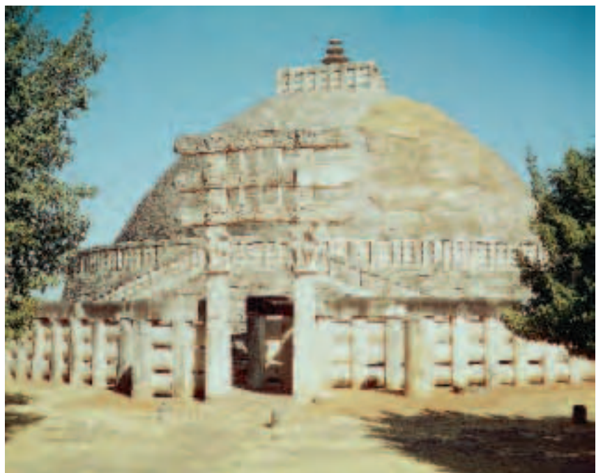
► FIGURE 12.9 Domes such as this were often erected over holy places, burial mounds, and holy relics. What is the purpose of preserving such things?

After the fifth century, Hinduism rose again in popularity because it was encouraged by the monarchs of the period. Hindu temples and sculptures of the Hindu gods were created. Hinduism combined several different beliefs and practices that developed over a long period of time. In Hinduism there are three primary processes in life and in the universe: creation, preservation, and destruction. The three main Hindu gods reflect this belief system.