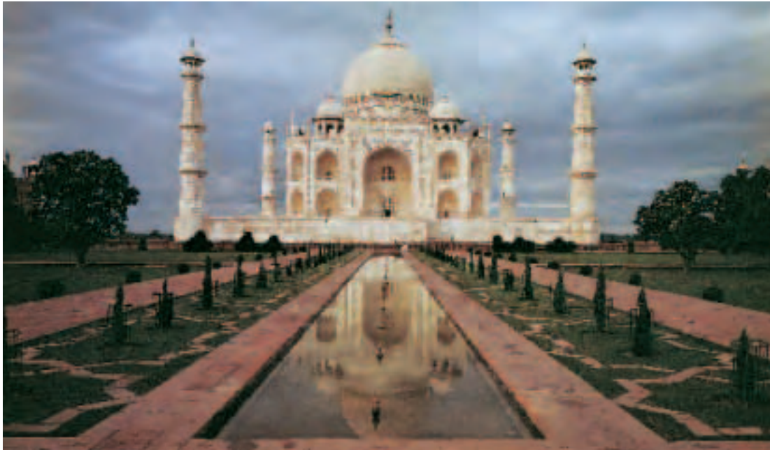
◀ FIGURE 12.16 This building was designed to be in harmony with the surrounding garden and pools. Notice the balance and symmetry of all the elements. What feeling does the building evoke?

Taj Mahal, garden and pools. 1632–43. Agra, India.