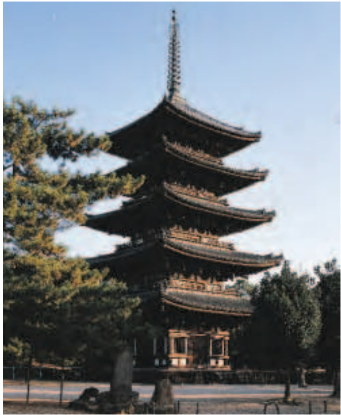
▲ FIGURE 12.13 This pagoda stands as the oldest wooden structure in the world. Its purpose is to preserve relics.

The Japanese also created monumental sculptures, often of the Buddha. Such a sculpture can be seen in Figure 12.14 , the Great Buddha at Kamakura. It was cast in bronze in A.D. 1252. It is situated outdoors in a grove of trees, which seems an appropriate setting for this contemplative Buddha.