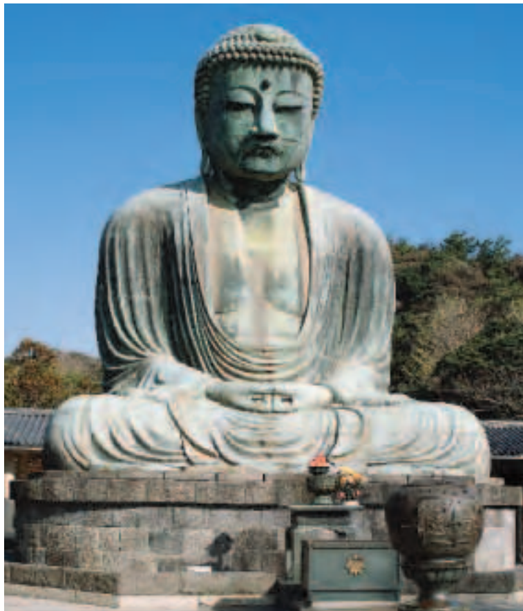
◀ FIGURE 12.14 The Great Buddha was once housed in a temple, but the temple was destroyed by a tidal wave. What effect does its current location have on this artwork?

Pagoda from the Temple Complex at Horyuji, near Nara, Japan. c. A.D. 616.